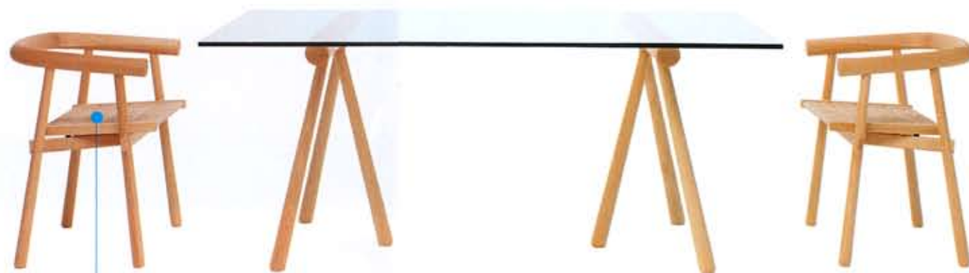
product Log Collection manufacturer Artelano website artelano.com Designed by Patricia Urquiola, this simple collection of turned wood features a chair, table, sofa, and ottoman.